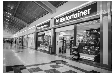
A modern day Entertainer store

As a result, The Entertainer gives back 10% of its profits to national children's charities. This approach also extends to the staff that can also give back through Payroll Giving with The Entertainer matching whatever the staff members contribute. As well as the employee schemes, customers in store can also make a difference through a national in-store scheme called 'Pennies'. This gives customers the opportunity to round up their purchase to the nearest