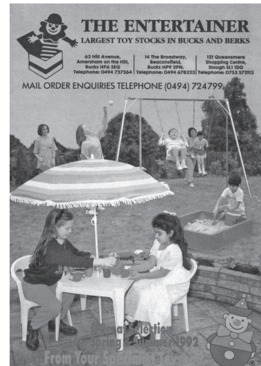
An early edition Entertainer store catalogue, 1992

This profitable association came to an end when Toy Stack was sold to Hamleys. Eventually Hamleys sold Toy Stack, enabling The Entertainer to move directly into the London area.