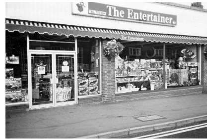
The first Entertainer toy shop in Amersham, 1981

The previous owner had an interesting approach to children - he simply didn't like them! The shop owner had a strange rule – that children were allowed in but they had to remain on the narrow carpet that ran down the middle of the store.